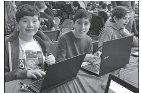
Eastport-South Manor students take part in the first-ever Kid-OYO Hack-a-thon.

Your Board of Education is excited about ESM's future. We are committed to remaining fiscally accountable to our taxpayers, while delivering the educational excellence our community deserves.