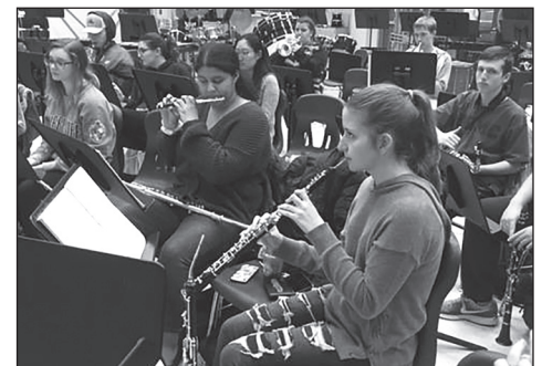
The ESM Theatre Department's Pit Band rehearses for The Little Mermaid .