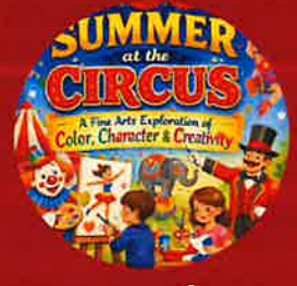
Summer Circus Art Exploration