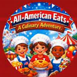
All American Eats Culinary Arts!