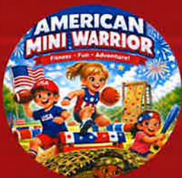
American Mini Warrior Physical Fitness

All-Inclusive SCOPE Enrichment: Four Curriculum Programs in One Registration