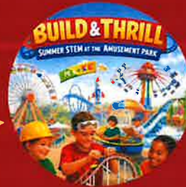
Build & Thrill STEM!