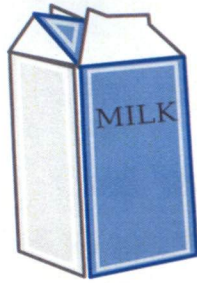
LOW-FAT, BOXED, & NON-REFRIGERATED MILK

While we continue to accept items outside of this list, we kindly ask you to focus your efforts with these items in mind so, together, we can have the maximum impact for individuals facing hunger.