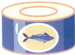
CANNED TUNA & SALMON