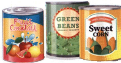
CANNED FRUIT & VEGETABLES