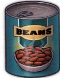
CANNED OR DRY BEANS (BLACK & RED PREFERRED)